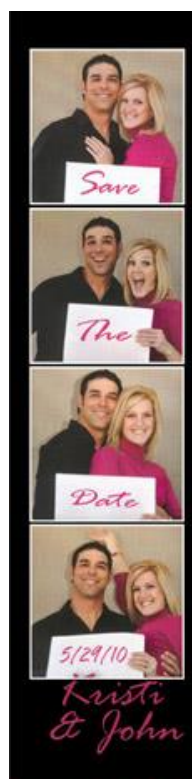
Save the Date 2x8" Magnets