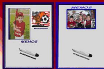
Dry Erase Memo Boards