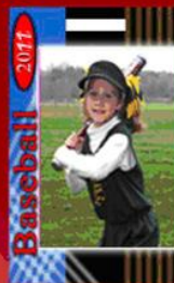
Brag Tags w/ strap