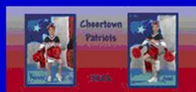
Beverage Can Wrappers