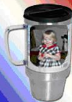
Stainless Steel Travel Mug