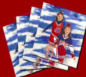
Coasters Set of 4